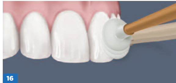
16 FINISH Removal of resin cement flash and finishing of the margins is best accomplished with the Enhance® Finishing System (see complete Directions for Use).

Rx Only Caution, Consult For Dental Use Only Instructions for Use