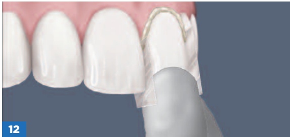
12 SEAT Seat restoration.