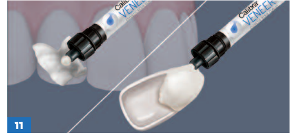
11 APPLY CALIBRA® VENEER CEMENT Dispense the desired Calibra Veneer Cement shade directly onto the veneer. Protect cement from exposure to light.