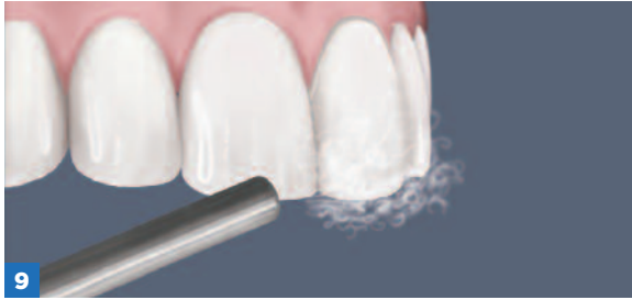
9 AIR DRY Gently air dry for 5 seconds.*