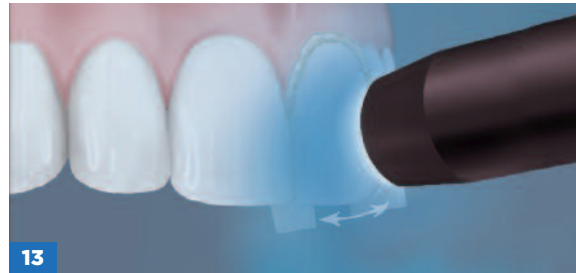
13 CLEAN UP EXCESS Tack the veneer in place by briefly light curing the gingival portion only for no more than 10 seconds.