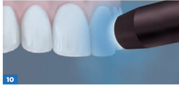
10 LIGHT CURE Light cure adhesive for 10 seconds*